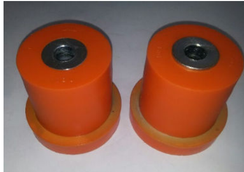
2x 1BU Polyurethane Pieces and 2x 1BH Tubes

The bush should be fitted on the wishbone such as the flange faces the rear of the car.